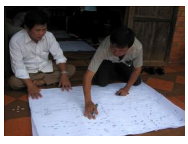
Village mapping of farmer club - hamlet 1, Hoa Binh commune, Xuyen Moc district, BR-VT extension method